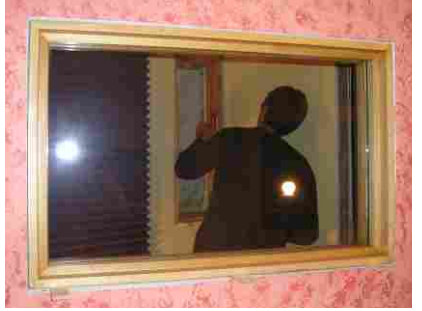
Installing the windows for the isolation booth