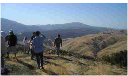
The incredible view from "Matt's Favorite Spot"