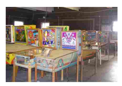
Most ranches have tractors in the barn; this one has pinball machines