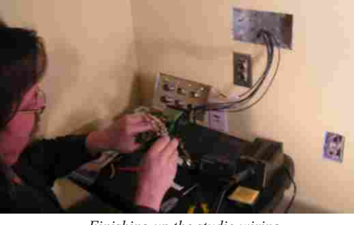
Finishing up the studio wiring