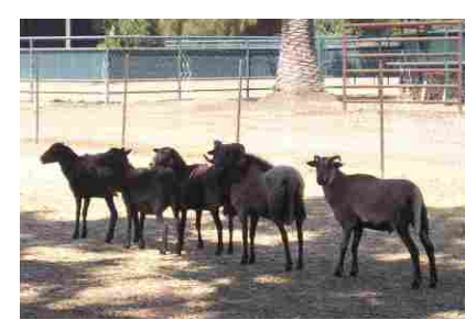
Some of the ranch locals