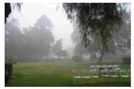
A beautiful foggy morning on the 2nd day