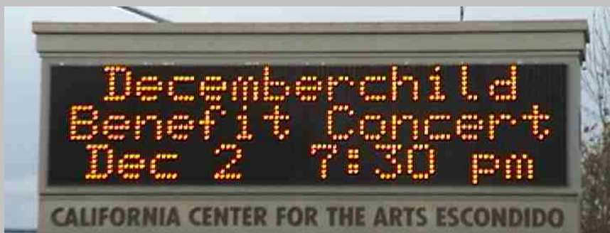
The Marquis in front of the CA Center for the Arts, Escondido