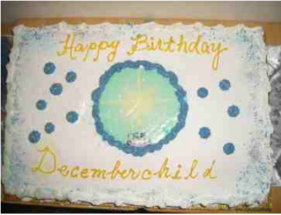
The Decemberchild Birthday Cake