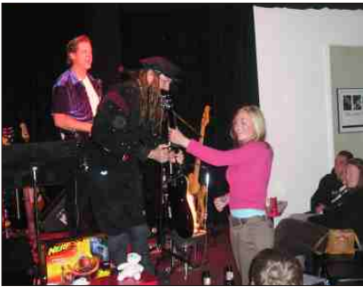
Handing out the grand prize guitar to the winner!