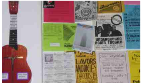
Can you find the last issue of S.F. News in this display?