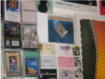
Fetal Pigs in Brine among the exhibit