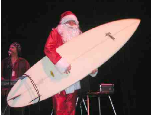
Santa with his sweet new custom Hamon shape