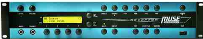
Receptor, from Muse Research