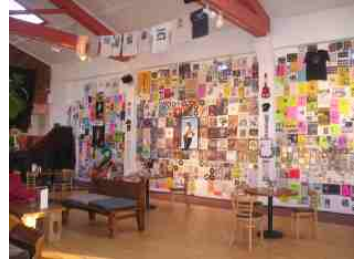
The "Santa Cruz Music Archives" exhibit