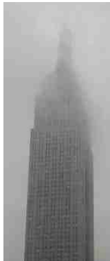
Empire State Building, New York City, 2005