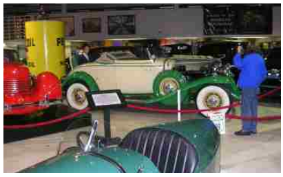
Jacob admires some stylish classics