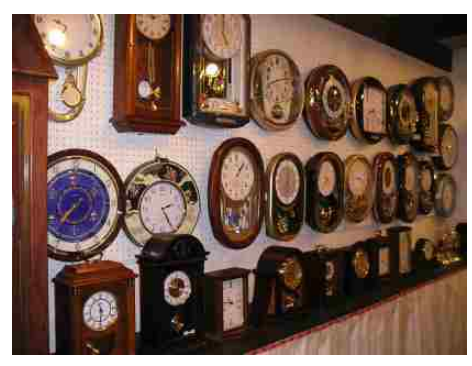
An old world clock store in Solvang