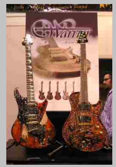
Some of the guitars are beautiful pieces of art on display at the Warrior booth