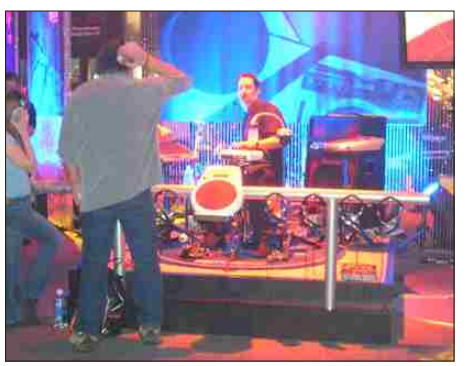
Just one example of the many colors, lights and sounds of the NAMM show