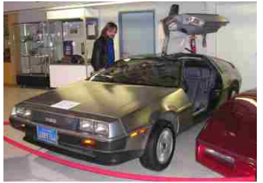
The DeLorean, best known from Back to the Future