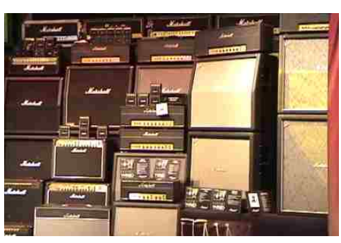
Now that's what I call a Marshall Stack!