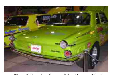
The distinctive lines of the Dodge Dart