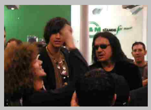
The Real Gene Simmons, cruising the NAMM show floor with full press and enterouge