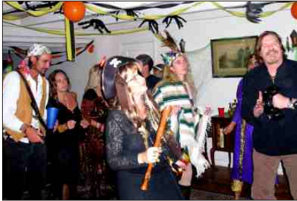
The crazy party people