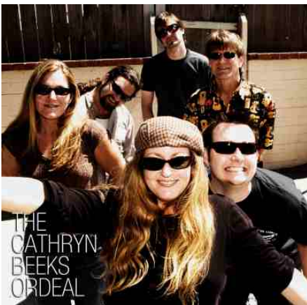
The Cathryn Beeks Ordeal