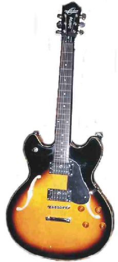
Raffle: Win a Guitar!