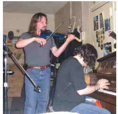
The jam session