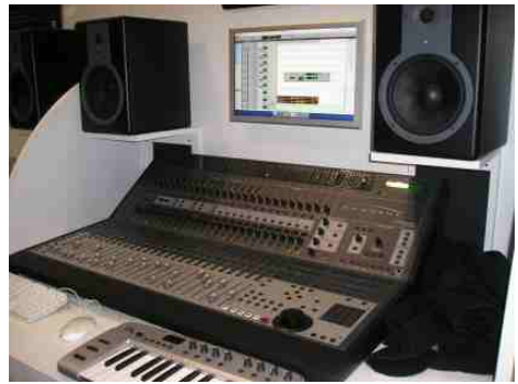
Tom got an impressive demo of this Pro Tools console. The Console's $8000, but the full system is $25,000.