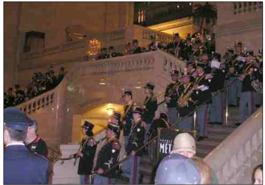
A band playing in Grand Central Station on Friday night