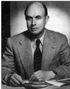
Dr. Fritz Sennheiser

Sennheiser is celebrating its 60th birthday. Started by Prof. Dr. Fritz Sennheiser, in post-war Germany, the company initially manufactured millivolt-meters for Siemens. This quickly led to designing microphones for radio stations and a series of early innovations such as the MD21, still in production today, the MD 82 shotgun mic, and then into wireless mic production.