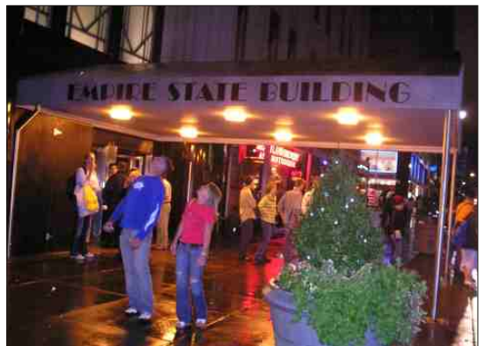
Friday night drizzle in front of the Empire State Building