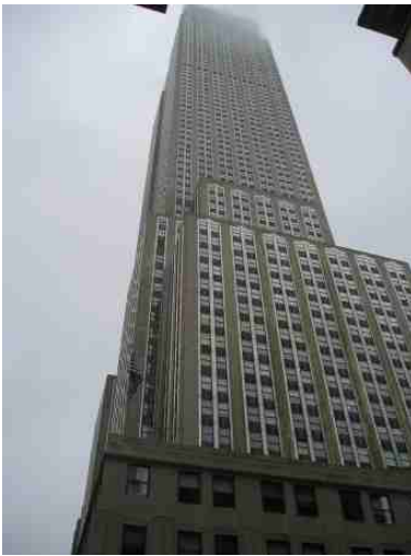
Empire State building, part 2