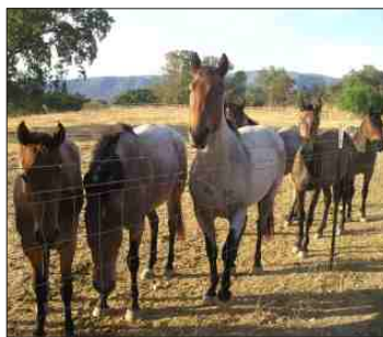
The horse says "Yeah, thanks guys!"