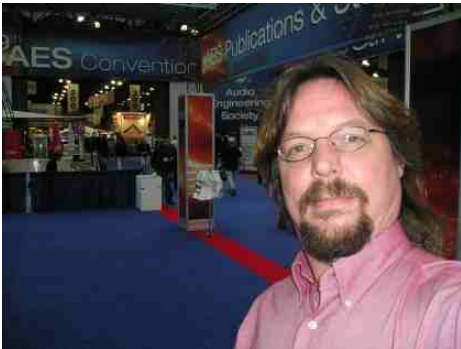
In front of the AES convention entrance, as the show was winding down