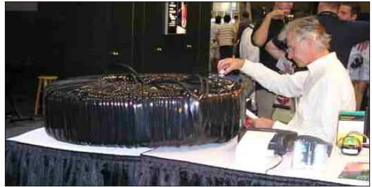
Yes, the transformer is really that big! This powers something BIG!