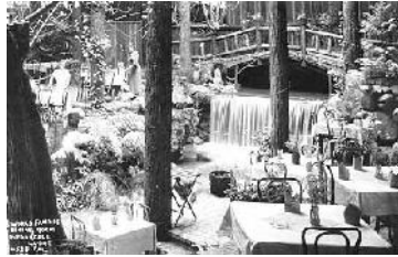
The Brook Room

For directions and more info on the Brookdale lodge. Visit the website at www.brookdalelodge.com