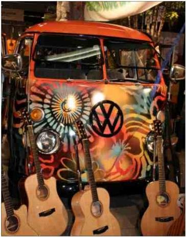
A beautifully painted, classic VW Bus at the Two Old Hippies booth