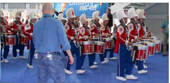
Los Angeles Unified School District All City Band marches through the Anaheim Convention Center