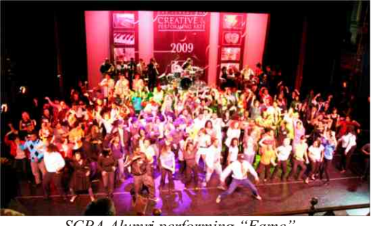
SCPA Alumni performing "Fame"