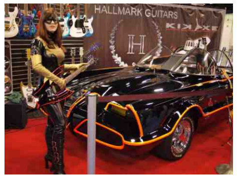
Batgirl jamming on a "Wing-Bat" guitar next to the classic Batmobile (from the 1960's Batman TV series) at the Hallmark Guitars booth.