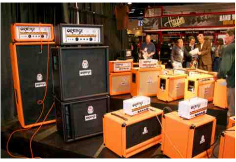
If the lone black amplifier could talk, it might say "What am I doing here?!"(to reference a quote from a classic Woody Allen movie) Looking slightly out of place at the Orange Amplifiers booth.