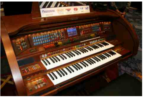
The spectacular Lowrey 'Legend' Organ on display in one of the many piano and organ rooms upstairs