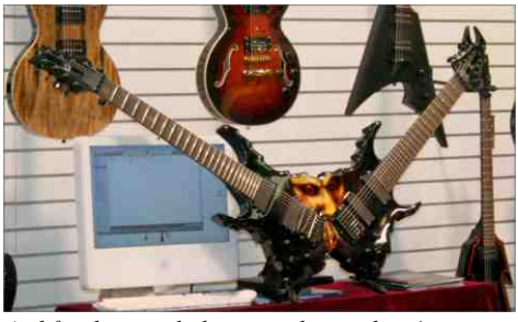
And for those ambidextrous players, here's a guitar that's both right and left handed at the same time!

Still Fumin' Records P.O. Box 66813 Scotts Valley, CA 95067 (831) 460-9837 www.stillfumin.com