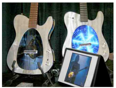
The Video Guitar, by Visionary Instruments. This actually has a video screen built into the body of the guitar. It can be hooked up to a computer to control the video being displayed