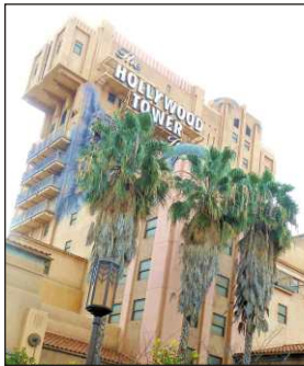
The gut-wrenching Hollywood Tower ride at Disney's California Adventure

Saturdays at the Winter NAMM show are always the most crowded, noisy, and flustering days to be walking the trade show floor. So rather than subject ourselves to the abuse, we went across the street to Disneyland and its sister park, Disney's California Adventure!