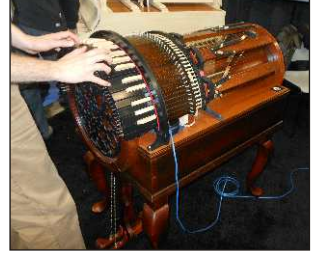
"Curved keyboard" version of the Wheelharp at the Antiquity Music booth