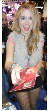
Trade Show Model

Most years at NAMM, Friday is probably the ideal day to be there. Thursday can be looked at as a "warm-up" day, but Friday is when everything is in full swing: The last minute details are completed, all the bugs have been worked out, and the celebrities have arrived, but the scene is thankfully lacking the overwhelming crowdedness of Saturdays at NAMM. Superior Olive took full advantage of the day while walking the floor.