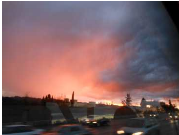
Beautiful Southern California sunset as seen from the freeway