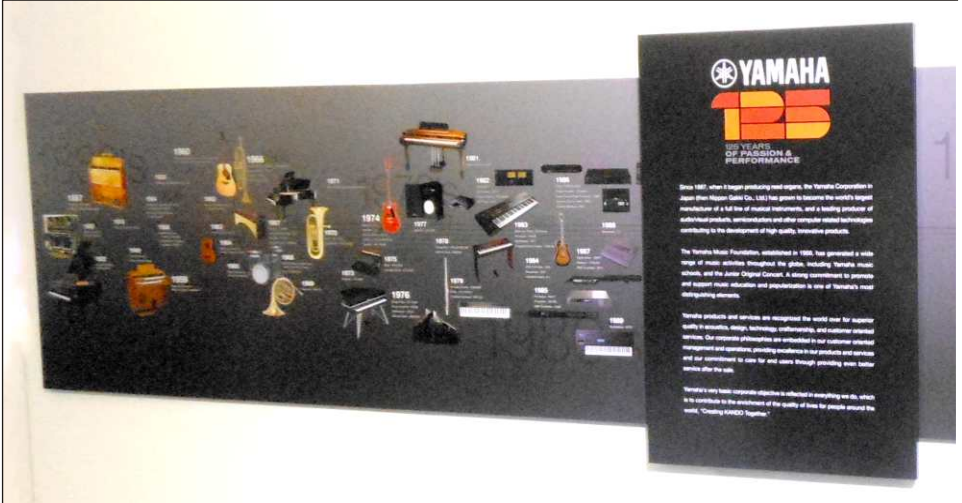
Yamaha honored its 125th year of manufacturing musical instruments with this wall-sized timeline