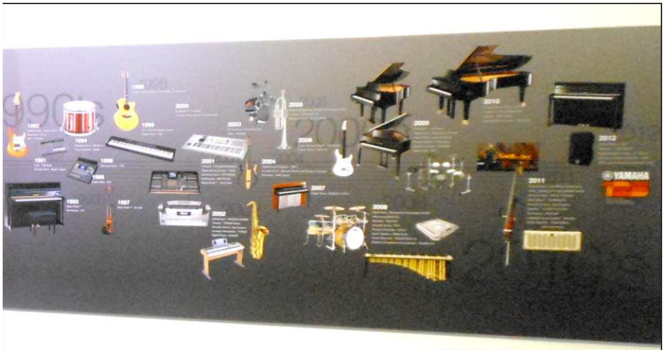
Yamaha honored its 125th year of manufacturing musical instruments with this wall-sized timeline