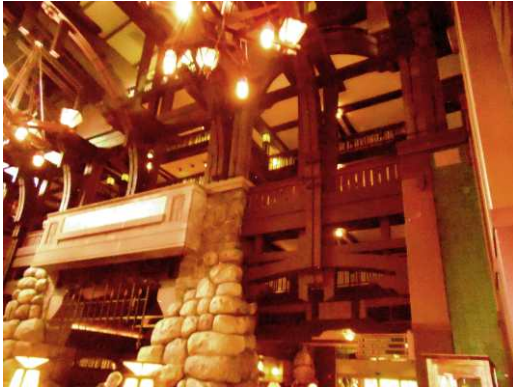
The spectacular lobby of Disney's Grand Californian Hotel where the Savell brothers stayed

Most years at NAMM, Friday is probably the ideal day to be there. Thursday can be looked at as a "warm-up" day, but Friday is when everything is in full swing: The last minute details are completed, all the bugs have been worked out, and the celebrities have arrived, but the scene is thankfully lacking the overwhelming crowdedness of Saturdays at NAMM. Superior Olive took full advantage of the day while walking the floor.