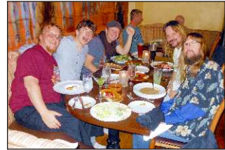
Superior Olive enjoying a fine meal at Catal, a great Spanish restaurant in Downtown Disney