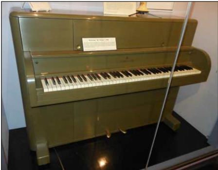
The Steinway "GI Piano", 1944. During WWII, thousands of these "Victory" pianos were shipped over-seas & parachuted into camp to boost morale & entertain US Soldiers.