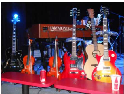
This year's raffle prizes were the best yet, culminating in these guitars and violins