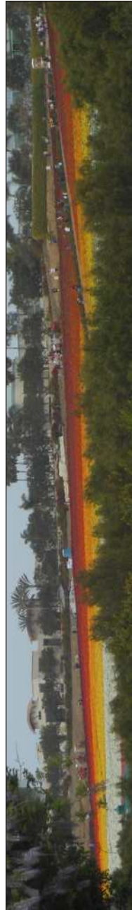
North County San Diego is famous for its colorful flower fields, arranged like gigantic paintings in the landscape, such as this impressive example seen from the road in Carlsbad, CA.