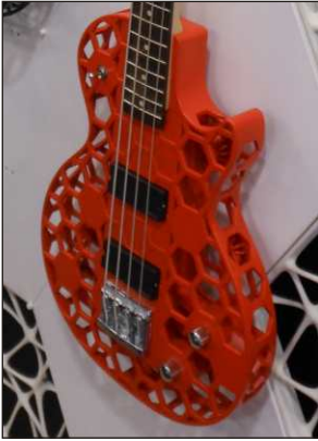
This intricate guitar body was generated by a 3D printer, as seen at the 3DSystems booth