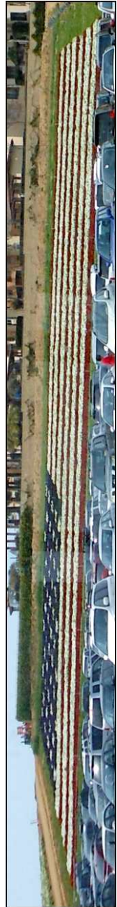
Red, White, and Blue flowers in Carlsbad, CA arranged as a football field-sized flag of the United States of America!