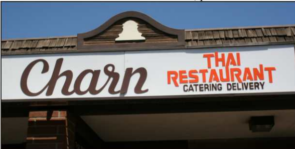
Charn Thai Restaurant sign, as seen right off the 101 freeway at Las Posas Rd in Camarillo, CA.

Tom and Jacob have been coming here for decades and are good buddies with Charn. If you're ever in the area and want excellent food, please visit them at 65 East Daily Drive in Camarillo.