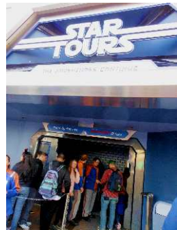
The famous Star Tours ride

First stop would be the Soarin' Over California ride in Disney's California Adventure, which takes the audience on a simulated flight over California's most beautiful areas, complete with the smells, sounds, and wind in your face. It is a total immersion experience and is alone worth the park admission price.