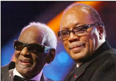
Quincy (right) seen here with Ray Charles

From USA Weekend, April 12-14, 2013 Issue.