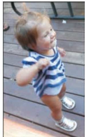
This little kid at Galice was totally rocking out!