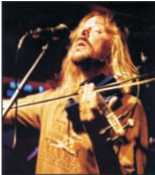
Great Photo of Tom