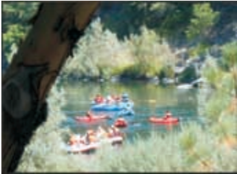
River rafters enjoying their day on the Rogue River in front of Galice Resort