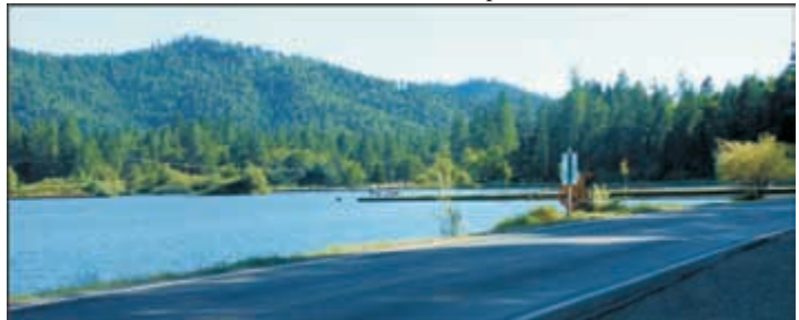
Scenic Lake Selmac near Grants Pass