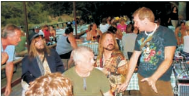
The band convenes on the nicely crowded deck at Galice Resort