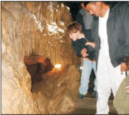
Kids and grownups alike can appreciate the unusual natural beauty