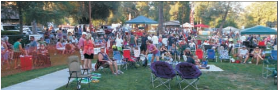
One small section of the huge crowd gathered for Friday Night in the Park