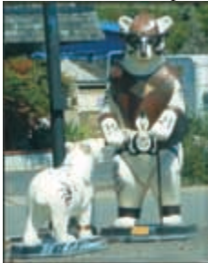
A bear-themed art installation at Grants Pass