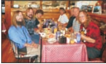
Enjoying a fabulous breakfast at the Old Mill Eatery