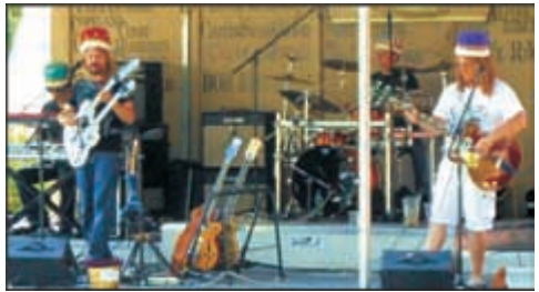
Tom Savell's Superior Olive Band wearing the King's, Pope's, Assassin's, and Poet's crowns as props for the Italian song Il Banchetto.

Touvelle Lodge is another favorite venue and popular biker bar. Touvelle features 2 stages: (one indoor, one outdoor), a friendly, tight-knit staff, and delicious burgers.