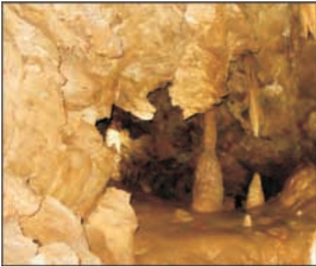
One of many fascinating formations seen underground in the caves