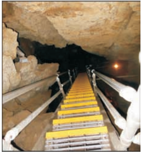
Looking down from the top of a long, steep flight of stairs in the caves