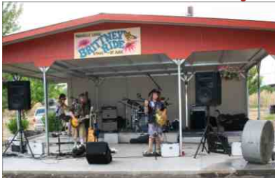
The outdoor stage at Touvelle Lodge- Notice the misting fan on the far right

After watching Chain Link at the Touvelle Lodge the day before, it was now our turn to play there. We had performed there the summer before, during the 2008 Tom Savell band tour, and one thing we had noticed during the Chain Link gig was how nice the stage was. Touvelle Lodge had recently built a new stage for their outdoor band area, and we were quite impressed.