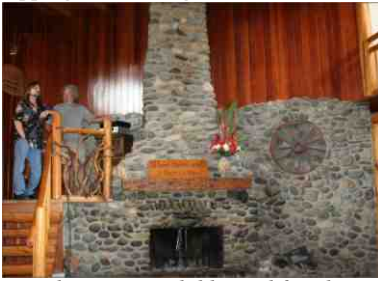
The awesome lobby and fireplace At Applegate River Lodge