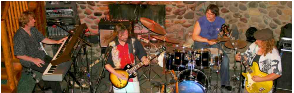
Superior Olive live at the Applegate River Lodge

The story of our time at Applegate River Lodge continues, so keep reading!