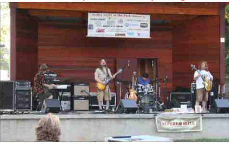
Superior Olive at Clair Engle Park