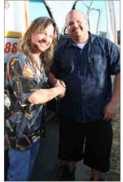
Thank God for Mobile Mechanics!