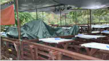
The patio stage area, after the first wave of rain and hail. Note the pile of hail on the upper right

Within a few seconds, the few drops had turned into a heavy shower. A few seconds after that, the heavy shower turned into a torrential downpour. Then the marble-sized hail started to fall. We quickly scrambled to get tarps over the equipment, then hid out in the RV.