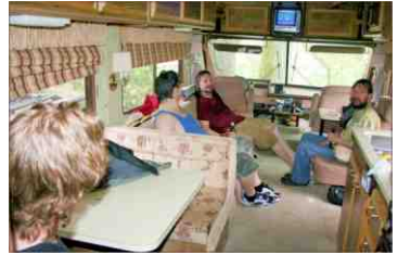
Luckily we had the RV to hide out in during the downpour