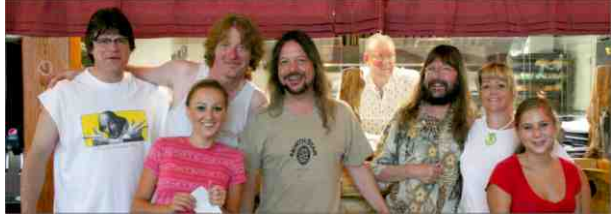
The staff at Oak Mill Eatery always make us feel right at home