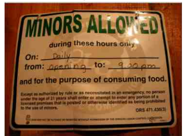
Minors are allowed in the bar/restaurant before 9pm or if they're eating food