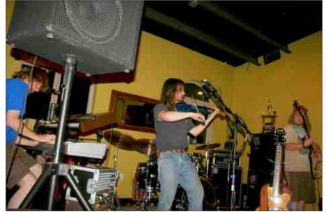
Superior Olive at the North Star Craft Brewery