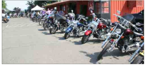
A well known local biker bar, Touvelle lodge had motorcycles lined up as far as the eye could see