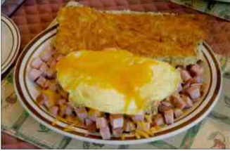
A breakfast masterpiece

Whenever we come to Shasta Lake, it is a necessity to have breakfast at the Old Mill Eatery. The ingredients, portions and friendly staff are simply awesome! The picture of the omelet below speaks for itself. Old Mill Eatery is located at 4132 Shasta Dam Blvd in Shasta Lake.