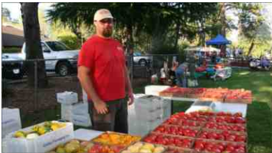
High quality fruit for the Farmer's Market