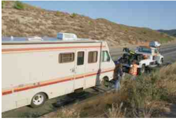
The coach after a burst tire, on I-5's notorious Grapevine