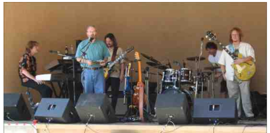
On the large outdoor stage at Felicita Park in Escondido, CA