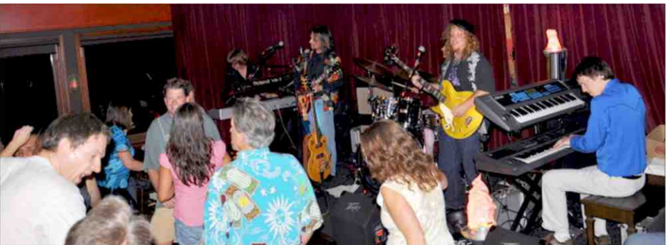
Superior Olive and one happy crowd at the Crow's Nest