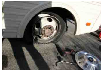
The carnage of the exploded tire