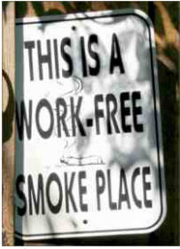
An important sign, read carefully!

For more info on the Applegate River Lodge, see www.applegateriverlodge.com .