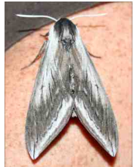
The famous moth on Joel's arm

At the beginning of the second set, a rather large, interesting looking moth latched itself onto Joel's arm and absolutely would not let go! No matter how Joel strummed, swayed, or rocked to the music, that big moth hung