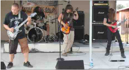
Chain Link performing at the Touvelle Lodge

After a great breakfast, we drove north across the state line to Oregon. Our first stop was actually at the place we were going to be playing at the next day- Touvelle Lodge in Central Point, near Medford. Our friends in the band, Chain Link were playing at a local "Battle of the Bands" competition. The 110 degree weather didn't stop them from rocking the packed outdoor stage area.