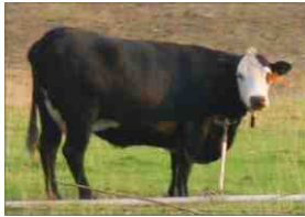
This pretty lady was watching the band from over the fence

After watching Chain Link at the Touvelle Lodge the day before, it was now our turn to play there. We had performed there the summer before, during the 2008 Tom Savell band tour, and one thing we had noticed during the Chain Link gig was how nice the stage was. Touvelle Lodge had recently built a new stage for their outdoor band area, and we were quite impressed.