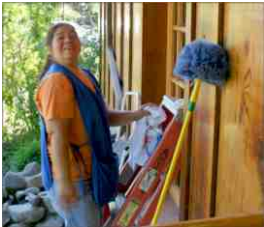
Each morning, this worker would meticulously clean every inch of the lodge