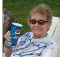
Enjoying the show!