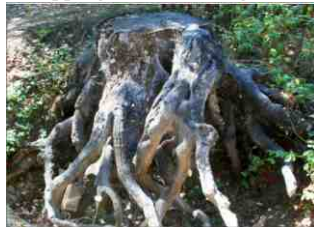
This massive tree was cut down and the root system was dug out, making a large underground pit