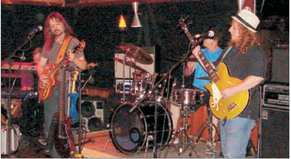
Superior Olive performing at the Trout Farm Inn