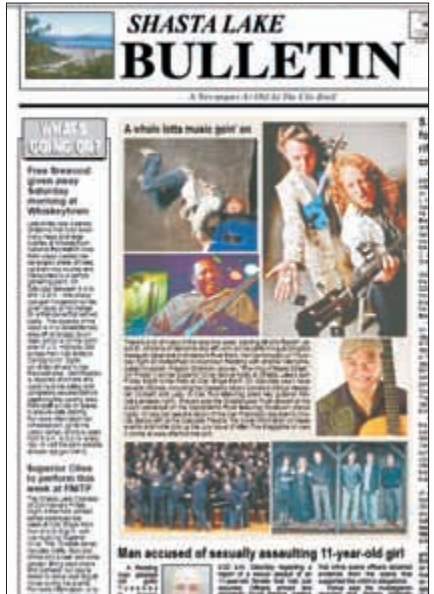
Front page of the Shasta Lake Bulletin