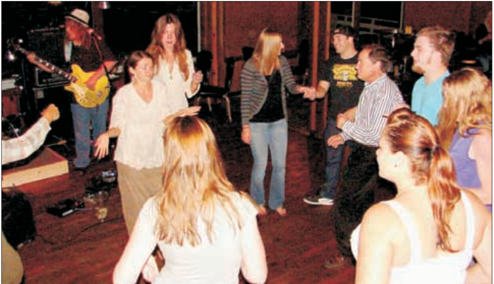
Fun loving people dancing to Superior Olive at the Trout Farm Inn