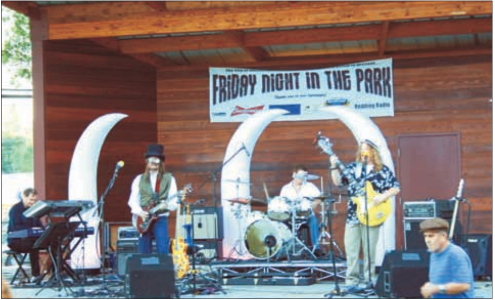
Superior Olive on the large stage at Claire Engle Park in Shasta Lake