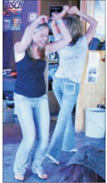
Local patrons show their appreciation for the music!