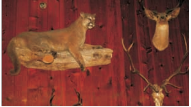
Speaking of wild cats, here is a stuffed Mountain Lion along with other impressive trophies on the wall at the Trophy Room