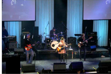
Live Performance at the New Music Awards