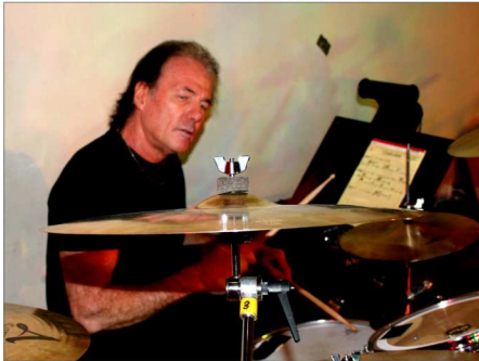
Aynsley Dunbar performing with Superior Olive