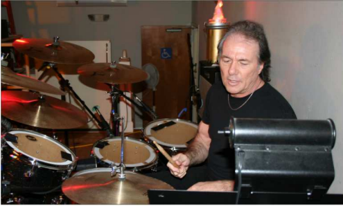
Aynsley Dunbar performing with Superior Olive