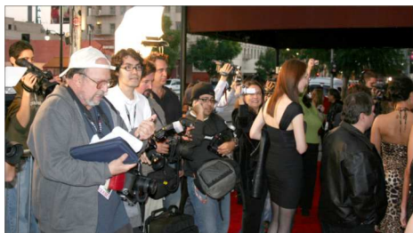
The frenzy of cameras at the red carpet walk

New Music Weekly held its annual New Music Awards show to a packed house in Hollywood, CA at the Avalon Theatre on Saturday evening, November 10th. Top honors went to radio stations, programmers and recording artists in a show that brought multi-genre artists together for performances and tribute, all under one roof.