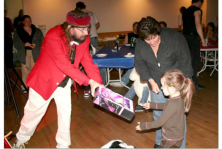
For the kids, there were both boy and girl prizes