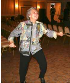
Dancing to the music