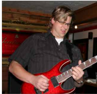
Ripping on guitar