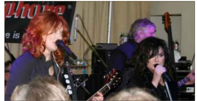
Heart rules! The Beautiful Wilson Sisters.