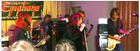
Bonus shots of Heart playing at the 2008 Epiphone NAMM party, at the Hilton's Pulse Lounge (see page 5)