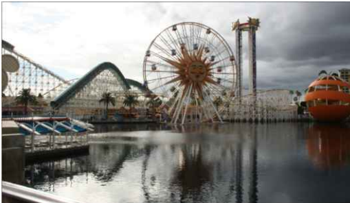
Paradise Pier, part of Disney's California Adventure