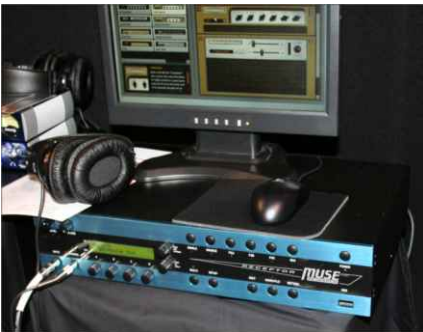
The Muse Receptor can process bass, guitar, and electronic drums at the same time.