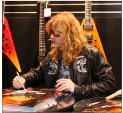
Dave Mustaine, founder of Megadeth and early Metallica guitarist