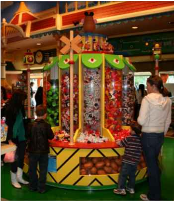
A Mr. Potato Head station at Disneyland's California Adventure. You can pick out parts from the various bins to build your custom Mr. Potato Head!