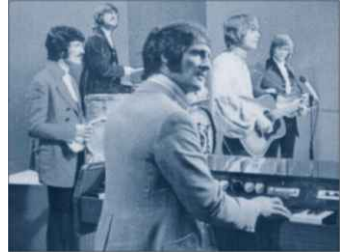
Mike playing with the Moody Blues, late 1960s