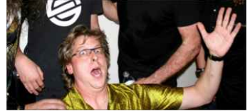
Posing backstage at Decemberchild 2007