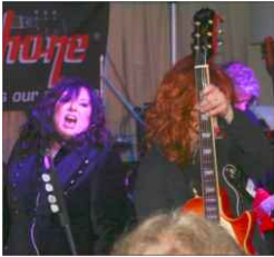
Ann and Nancy, rocking hard

Heart was amazing. I have always liked this band, especially their harder rock songs like Barracuda, Magic Man, and Crazy On You, but seeing them in person really gave me a greater understanding of how powerful they really are. Led by the sisters Ann and Nancy Wilson (not related to Beach Boy Brian Wilson or his daughters in the singing duo "Wilson"), the band ripped through a thundering set in front a packed, standing room only crowd at the Pulse Lounge. Heart is one of the all-time great rock bands. Ann Wilson's vocals were just flat-out brilliant that night. She is the real deal, no pitch correction or "studio magic" is necessary with her voice. As good as she sounds on the records, believe it or not, she actually sounds better in person. Her sister Nancy (redhead) provides the signature driving rhythm guitar, backing vocals, and lead vocals on a few key songs like the ethereal "These Dreams"