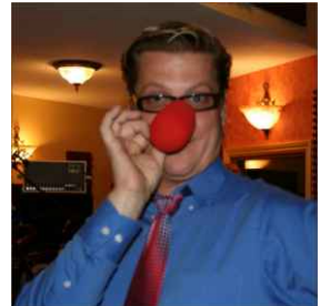
I think he had a cold that day, so his nose was a bit red.