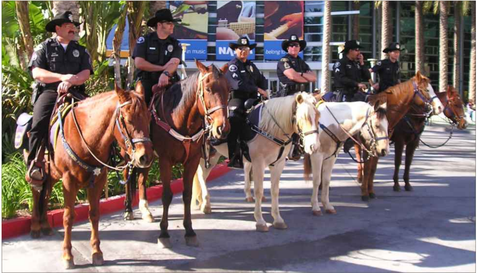
Anaheim's finest horses: The Anaheim Police Dept. Cavalry, on duty outside the Anaheim Convention Center, site of the 2008 NAMM show