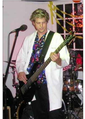
Like a Doctor, putting on a bass clinic