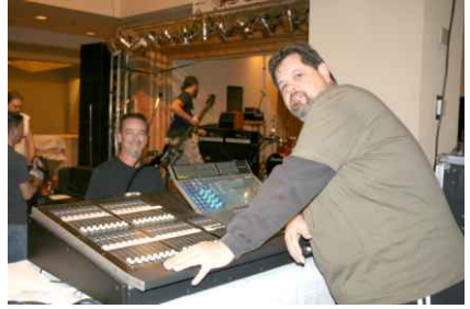
The soundman for Heart getting set up before the show