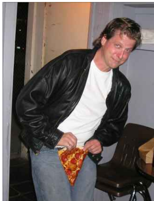
Showing off his tan lines