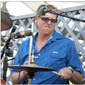
Power Rock Drummer Face