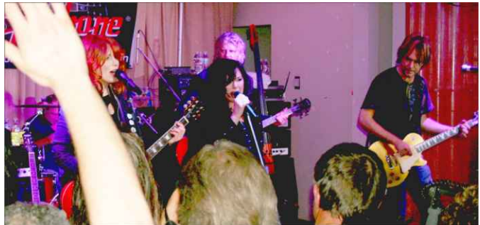
Heart kicks the standing-room-only crowd's butt