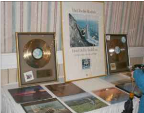
A Display of Bruce's Album Cover art, gold records from the Doobie Brothers