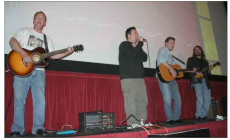
Blueprint with the Del Mar Theatre screen as the backdrop