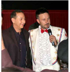
Paul Ruebens and David Arquette

The 2007 Santa Cruz Film Festival went off in grand fashion. Last year Superior Olive & Blueprint played for the Festival on the final night at the Attic. This year, Blueprint played on the opening night, April 19 th at the Del Mar Theatre in downtown Santa Cruz. Also there was actor David Arquette, who is making his directorial debut with the new horror movie "The Tripper", partially filmed in Santa Cruz County. Joining Arquette for the screening was the leading cast of "The Tripper", including Paul Ruebens, best known as Pee Wee Herman.