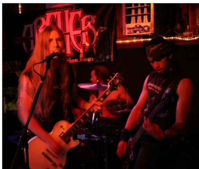
Archer rocks at Henfling's

With their upcoming trip to Europe to share the stage with Heaven and Hell (Dio, Iommi, Butler, Appice) and others at the Bang Your Head Festival , Santa Cruz rockers Archer are ready to blast their way onto the worldwide scene. I recently sat down with the band to get some insight into their music. I got answers, some candid, and some tongue-in-cheek, to questions that I hope will illuminate the people behind the music.