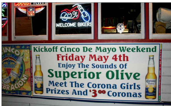
Check out the cool sign they made for us!

Superior Olive returned to Henfling's Firehouse Tavern yet again on Friday, May 4 th . To help kick off Cinco de Mayo weekend, The Corona girls were there as well, making sure everybody was having a fun time (responsibly of course). A mixed crowd of bikers, hippies, and "regular" folk danced and rocked the night away. Superior Olive played until well past midnight, capping the show off with a 90-minute super-set that left the crowd screaming for more!