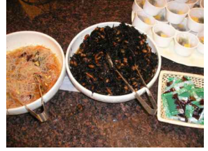
Japanese breakfast buffet