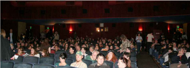
The Santa Cruz Film Festival Audience