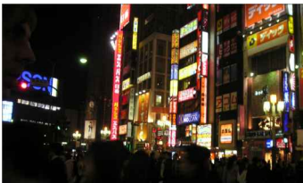
City lights at the Shinju-ku area of Tokyo

vegetables, interesting pickles, various kinds of fish such as salmon, miso soup, and other traditional Japanese foods. The American Breakfast had eggs, bacon, sausage, rolls, coffee, and juice.