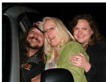
Fans after the show