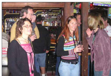
Friends of the band