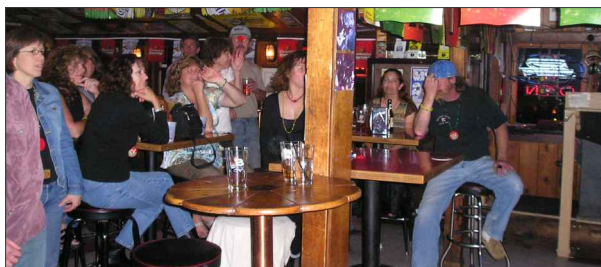
The Henfling's crowd