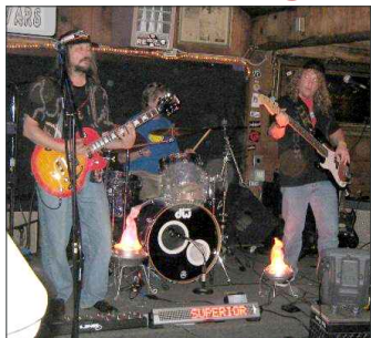
Superior Olive rocks!

Superior Olive returned to Henfling's Firehouse Tavern yet again on Friday, May 4 th . To help kick off Cinco de Mayo weekend, The Corona girls were there as well, making sure everybody was having a fun time (responsibly of course). A mixed crowd of bikers, hippies, and "regular" folk danced and rocked the night away. Superior Olive played until well past midnight, capping the show off with a 90-minute super-set that left the crowd screaming for more!