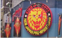
This sign was a useful landmark

Each morning before the meetings, Tom had breakfast at the hotel. The breakfast buffet consisted of two sides: Japanese Breakfast and American Breakfast. The Japanese Breakfast had