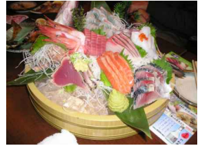
A beautiful bowl of fresh sashimi