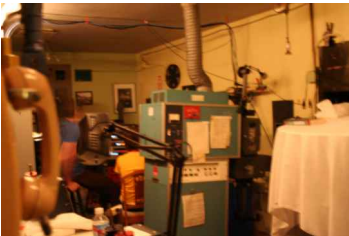
The projector room at the Rio Theatre