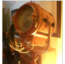
A spotlight stored in the Crying Room